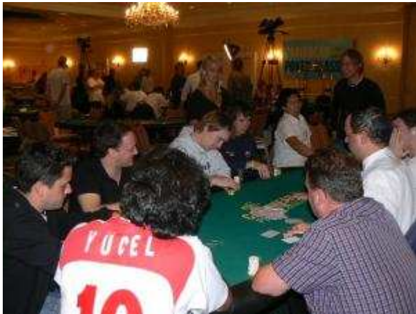
Two final tables going on simultaneously. In front the $400+40 PLO, in back the $500+50 no-limit hold'em